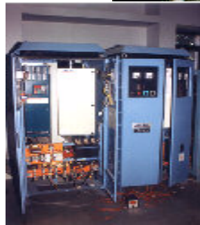
25KVA On Board Inverter supplied to RCF, Kapurthala

This 25 KVA On Board inverter has been specially developed for supplying power to Railway AC coaches. The design and development of these compact and rugged power supply units was carried out, in house at Hi-Rel. These units undergo rigorous test for vibration (3 Dimension), damp heat and dry heat conditions and stand out for their extreme reliability under roughest environmental conditions.